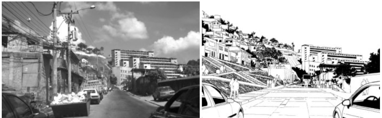
Figure 7 – Proposed entrance square to Providencia community

We established 4 urban design patterns , to fit street dimensions and functions, 4 focal points , including new squares and meeting points, as exemplified in Figure 7, and 6 circulation connections , where major crossings and transportation links are planned.