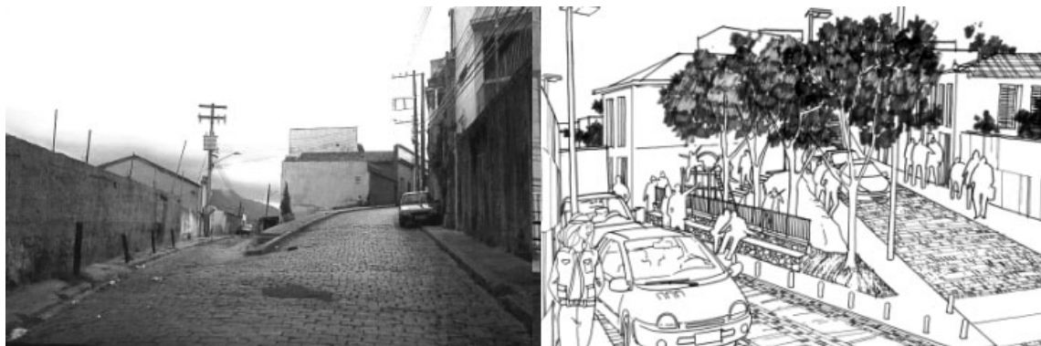
Figure 4 – Proposed a pocket park close to local church at Na. Sa. do Livramento Square