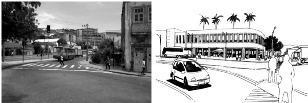
Figure 6 - Largo de Santo Cristo Square, facing the Gamboa housing complex