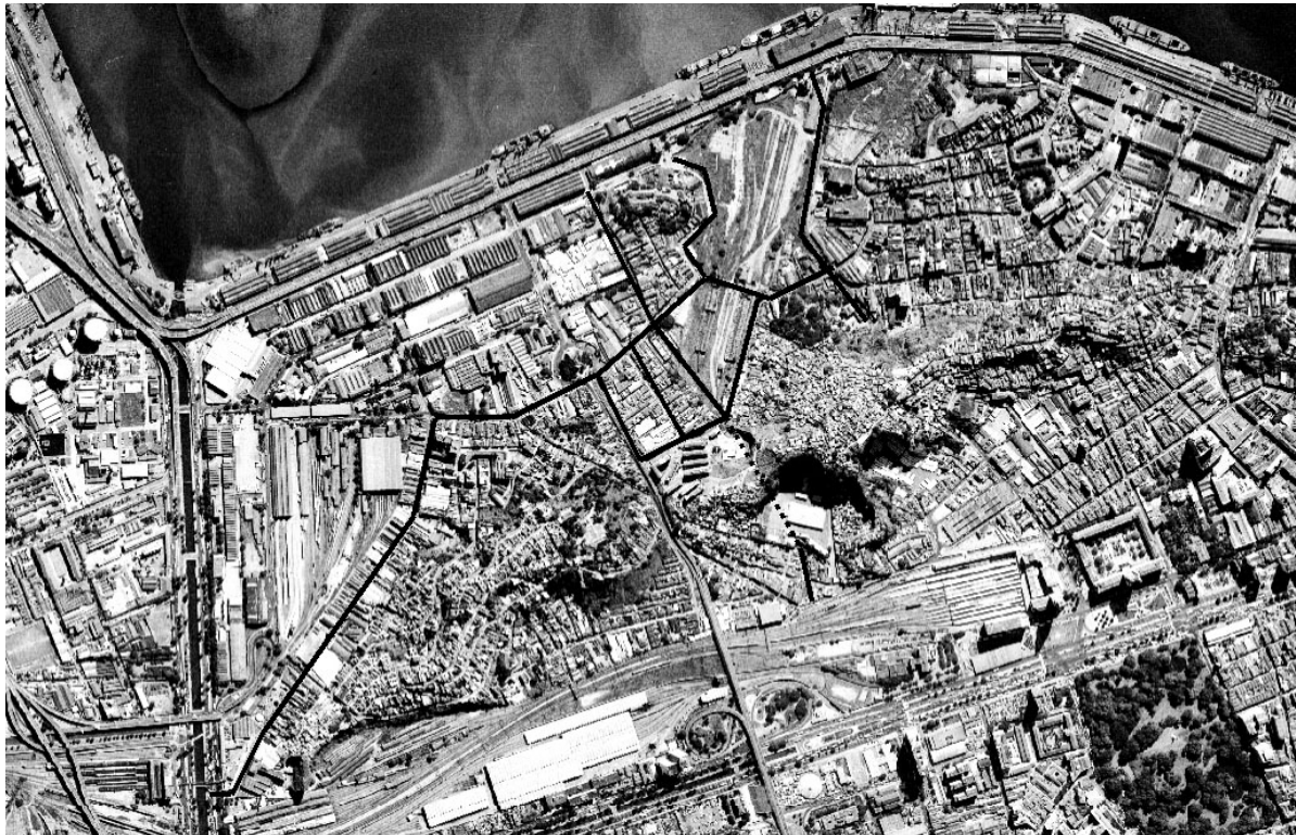
Figure 2- General view of the docklands region with the indication of the study areas

Our concept was based on the establishment and definition of project urban design patterns , as selected by our team according to the communities social needs and cultural profile, for linear and continuous application, along the streets, sidewalks, stairs and alleys, and of focal points , for specific application in identified special open spaces and road connections.