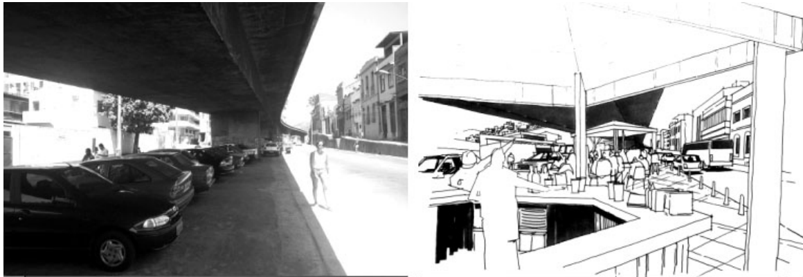
Figure 5- Refreshments Square under the highway, serving Providencia community