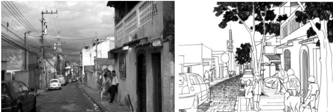
Figure 3 – Proposed pattern in Ladeira do Barroso for preserving residents habits

The building materials, mostly natural stone made, as well as the lighting equipment and urban equipage were carefully chosen in order to enhance the ambiance without transforming people's environmental perception and daily activities.